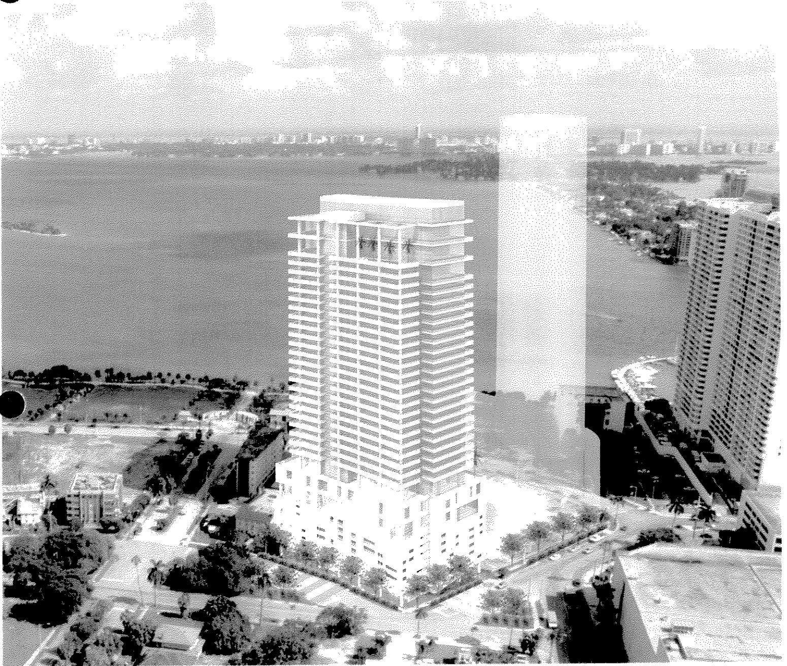
Substantial Modification to Miramar Centre Phase II & III Resolution #01-199 Hotel de l'Opera, 1171 NE 4th Avenue Miami, Florida